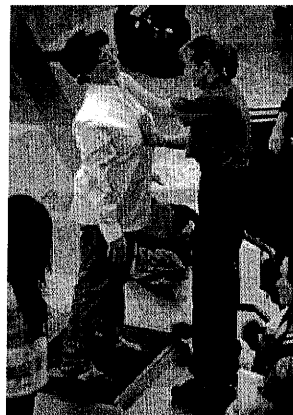
Transportation Security Administration agents perform enhanced pat-downs on passengers at DIA on Wednesday amid growing controversy about the screenings and full-body scanners, one week before Thanksgiving air travelers crowd airports.

Obama asks whether there are less-intrusive options