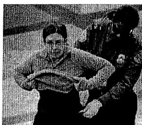
A passenger at Denver International Airport on Wednesday