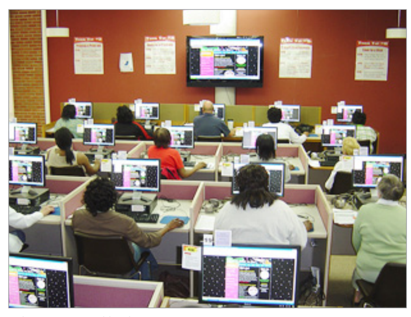
York County (S.C.) Public Library.

ple) used library resources to help address career and employment needs in the last 12 months.1